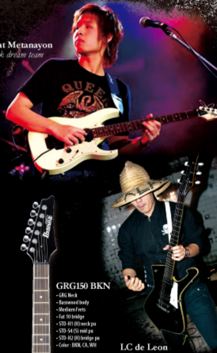
LC de Leon Reklamo