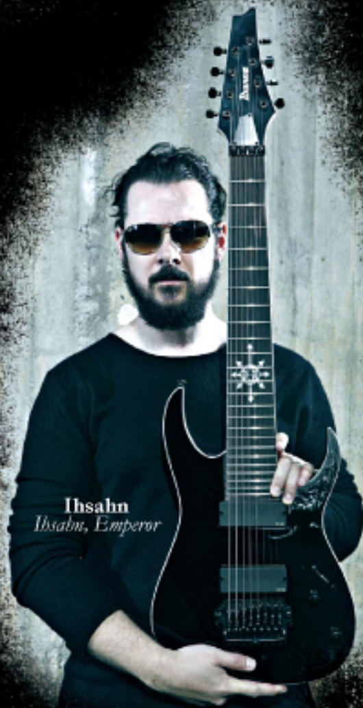
Ihsahn Ihsahn, Emperor