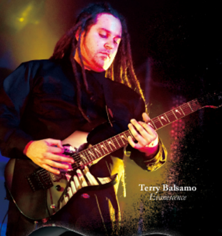
Terry Balsamo Evanesence